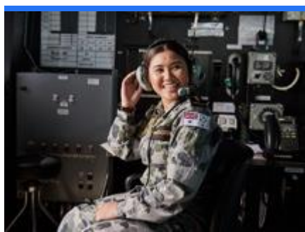
Communication Networks Operator Submariner

Fast-Track Career Opportunities: Looking to join as soon as possible and want to start training in the next 3-6 months? You could consider fast tracking your career with a priority role by connecting with someone by emailing navyjobs@dfr.com.au .